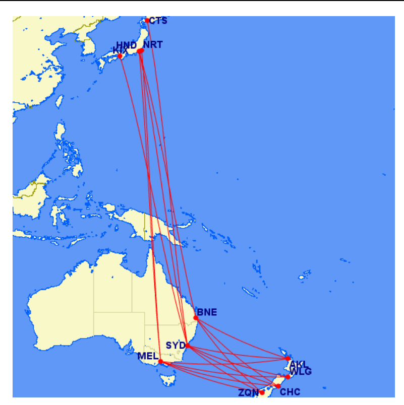
Figure 4: Combined JAL-Qantas Australia-Japan and Trans-Tasman Networks

In addition, as noted earlier, the Proposed Conduct also provides the platform for the potential increase in frequencies and/or gauge operated by Qantas on the Tasman. While it is too early to predict the timing or extent of such increases, it is more likely to occur with the Proposed Conduct than without it. The Applicants' expanded codeshare will attract more passengers transiting from New Zealand to Japan via Australia, travelling on the new codeshare services to and from each of Christchurch, Wellington and Queenstown (as well as the existing code on Sydney-Auckland services). Passengers travelling between New Zealand and Japan via Australia are expected to take advantage of new schedule options and other consumer benefits such as increased frequent flyer entitlements and fare flexibility. Hence, if the additional codeshare services generate higher loads of passengers transiting between New Zealand onto Japan then Qantas will be in a better position to increase Tasman services as well, to the benefit again of both the Australian and New Zealand tourism industries and economies. In expanding the codeshare, the Applicants would work on maximising schedule connectivity and itinerary choice.