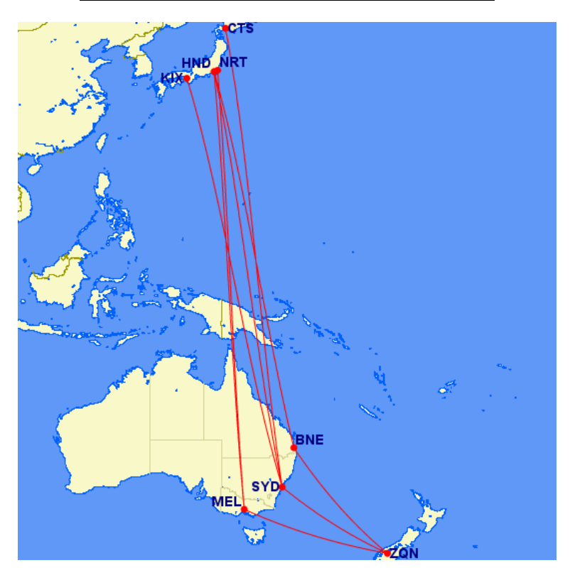
Ex Wellington to Osaka, Sapporo and Tokyo