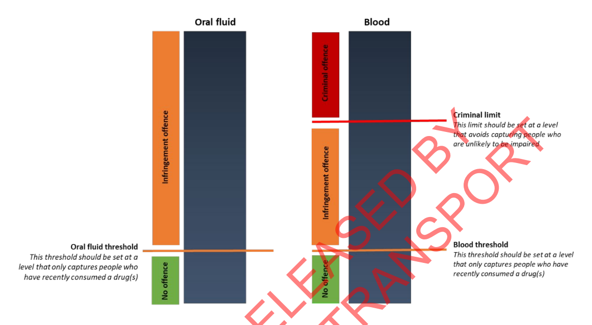
Figure 2: Drug thresholds and limits

22.3 oral fluid infringement thresholds set in roadside testing devices will determine the level at which a person gets a positive result on an oral fluid test, leading to an infringement offence at the roadside.