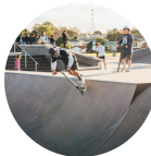
Randwick Park, New Zealand

Places for the Young The demographics of Mangere indicate that there is a big young population. There is a need to increase amenities, offerings and social infrastructure that build places for the young population in the area: playgrounds, community centres, parks, workshops, etc.