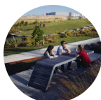
Kopupoko Reserve, New Zealand

Te Ararata Creek Changes in the masterplan across Bader include a more resilient approach: Te Ararata Creek is transformed into a larger public amenity that becomes more resilient to flooding while providing an open space to the area. With ALR station along Hall Ave, there is the opportunity to integrate and leverage this amenity in the East-West corridor.