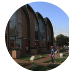
Intergenerational living concepts, New Zealand

Multi-Generational Housing There is a large proportion of Maori and Pasifika families living in Mangere. The proposed urban form and housing typologies will respond to the needs of the demographic groups through principles of resilient living. Intergenerational and adaptable units for large families.